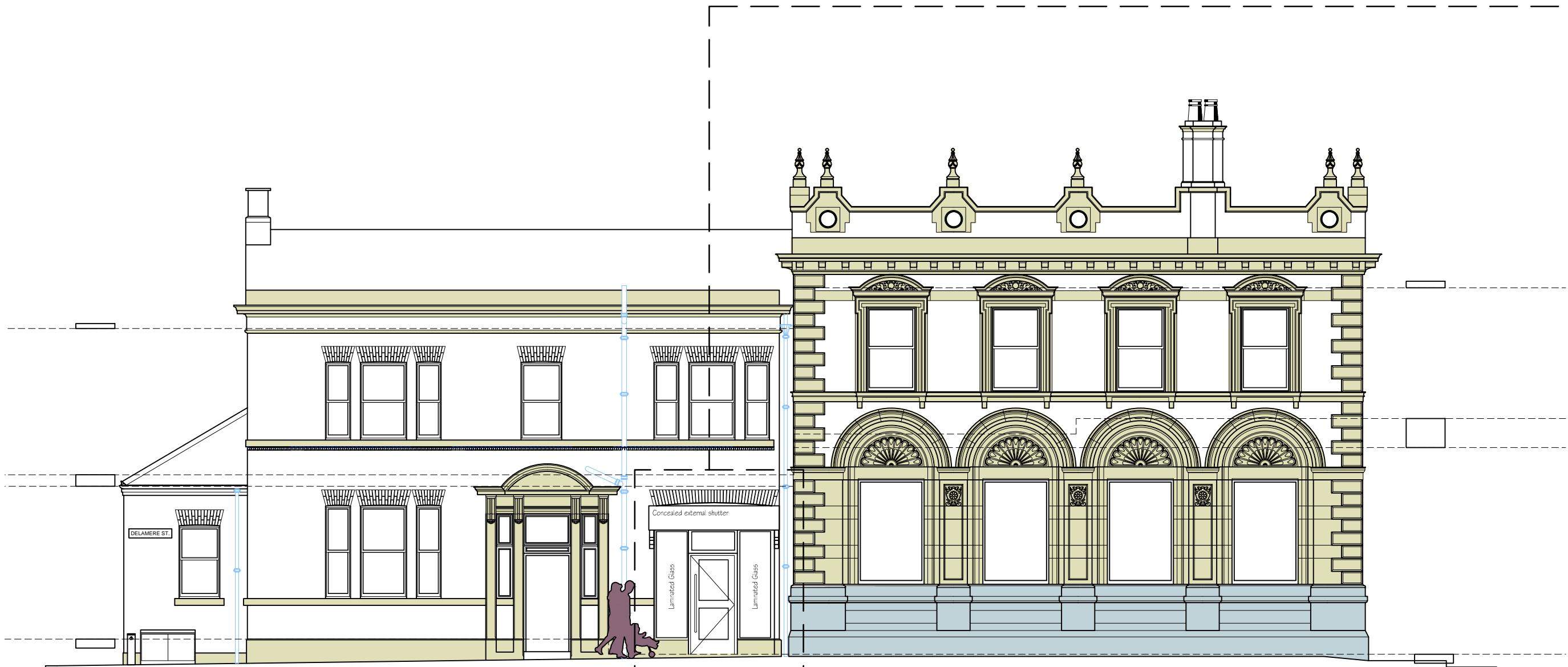
SIDE ELEVATION [DELAMERE STREET], LOOKING WEST